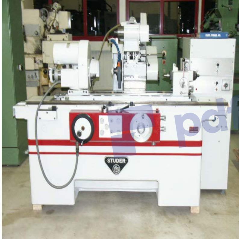
STUDER High Precision Universal Grinder SU 30 RHU650