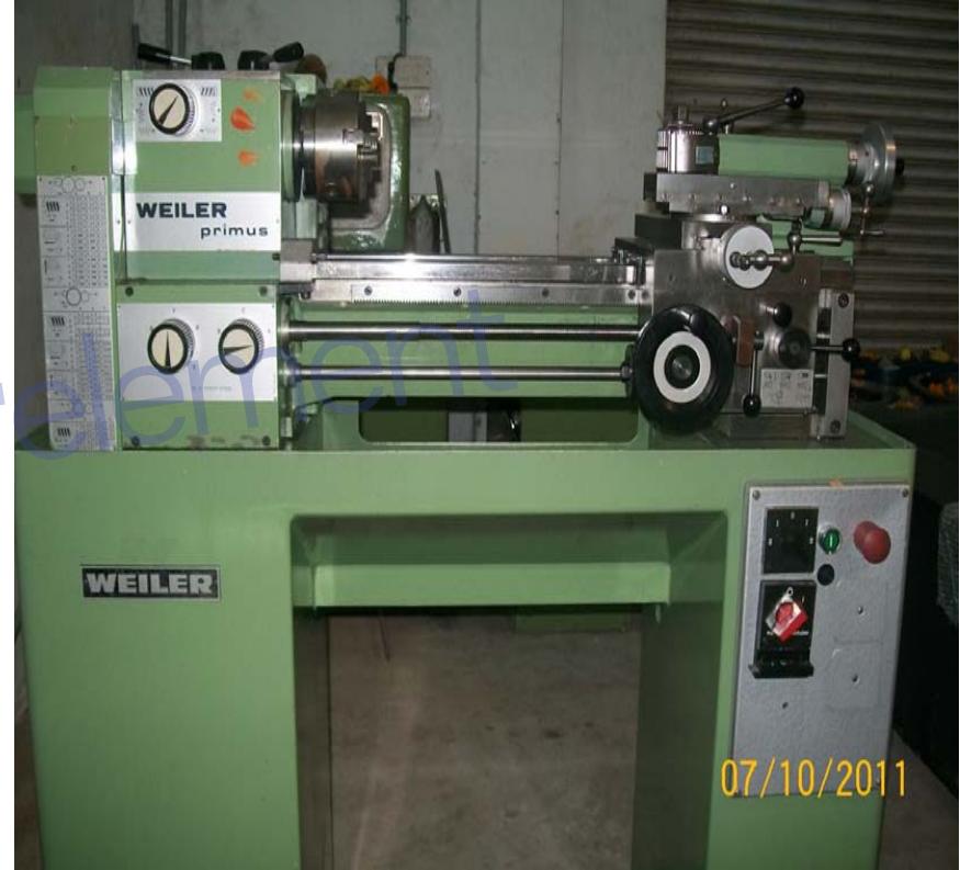
WEILER Precision Lathe PRIMUS LZ